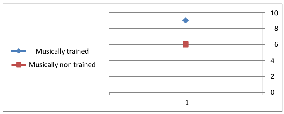
Figure 4. The difference between musically trained and non- trained undergraduate students on Backward Digit Recall Test

Note.: ETA Square = 0.821. High size effect (Cohen, 1988 suggested that =0.2 be considered a 'small' effect size, 0.5 represents a 'medium' effect size and 0.8 a 'large' effect size).