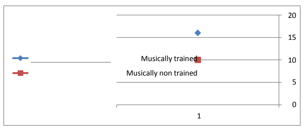
Figure 3. The difference between musically trained and non- trained undergraduate students on word recall test

As to the fourth hypothesis ,"There are significant differences between musically trained and non- trained undergraduate students on Backward Digit Recall Test in favor of musically trained students", results as shown in table 5 and figure 4,there are significant difference(p < .01) between musically trained and non- trained undergraduate students on Backward Digit Recall Test in favor of musically trained students. As musically trained undergraduate students got 9 points( i.e. the number of correct items was 9) they, while non- trained undergraduate students got 6(i.e. the number of correct items was 6).